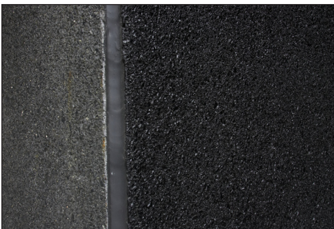
Series 620 Phylon 1422 was spray-applied to the Bank of America Stadium providing a barrier against ultraviolet light and weather deterioration.